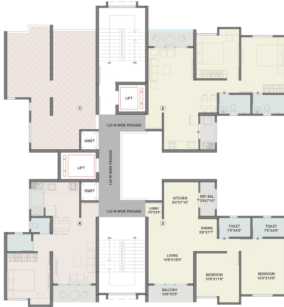
Tower 5 Refuge 7th,12th,17th Floor Plan