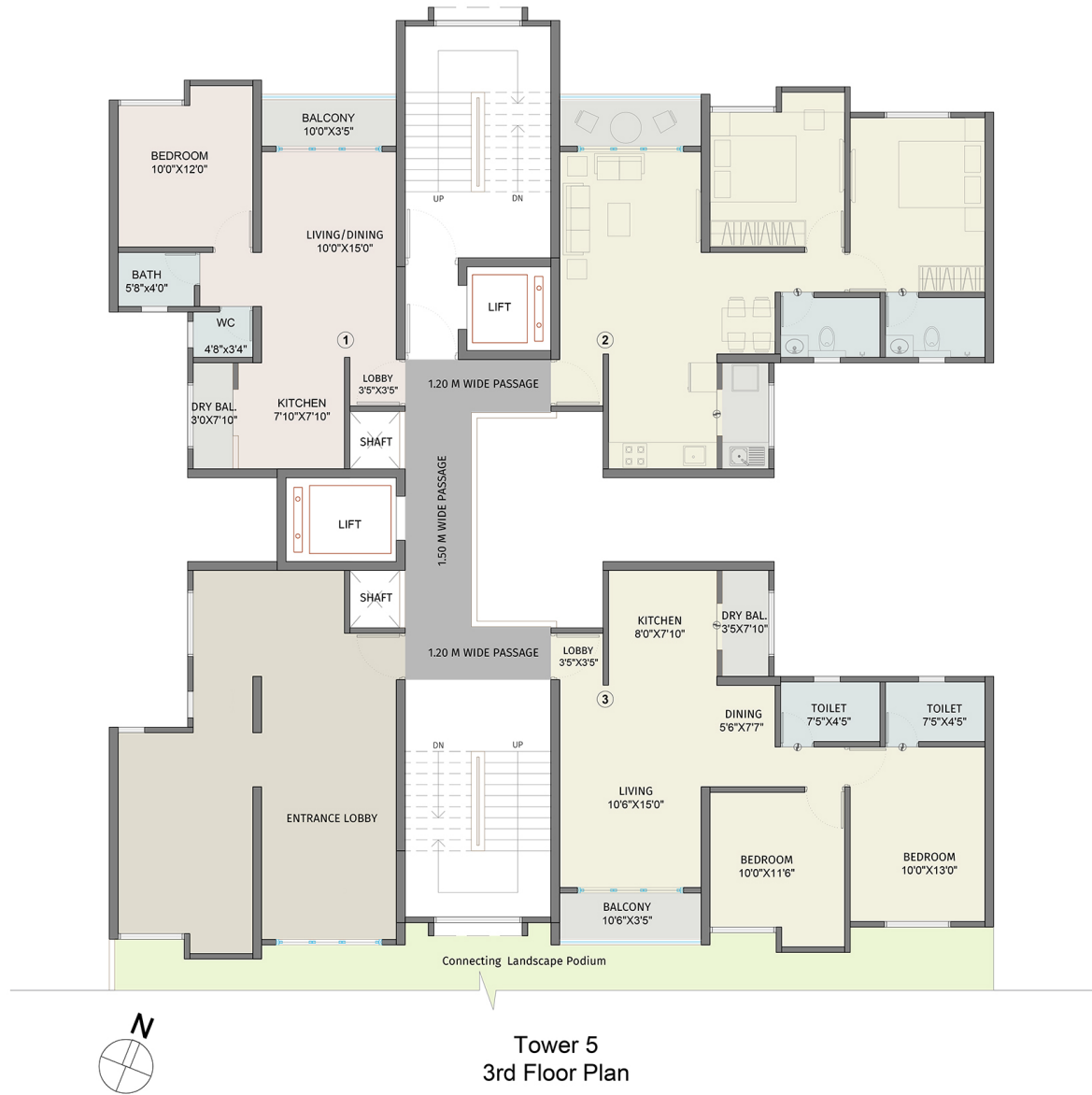
Tower 5 3rd Floor Plan